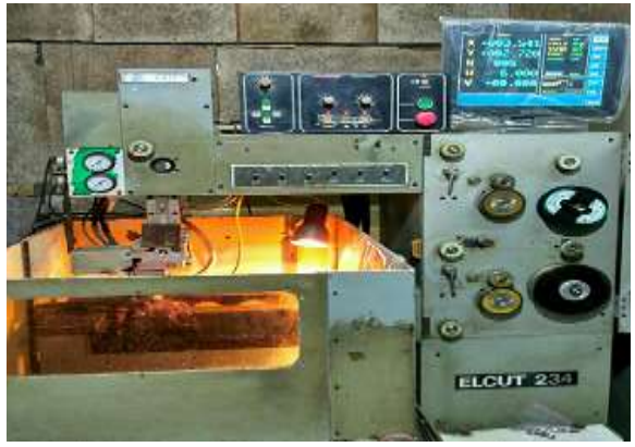
Fig.1: ELCUT 234 machine

Due to the ease in availability and conductive nature a mild steel work piece having composition C 0.28%, Mn 0.44%, P 0.04% S 0.02% and Si 0.16% [wt %] were selected as work piece. Molybdenum wire having 0.25 mm diameter was selected as electrode. ELCUT 234 machine [fig.1] Molybdenum wire having 0.25 mm diameter was selected as electrode. ELCUT 234 machine [fig.1] having 3-\phi , AC 415 v, 50 Hz was used to perform the experiments.