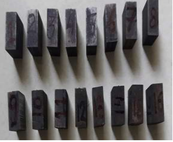
Fig.2: Cut Pieces of Mild Steel

The cut pieces of mild steel having 10 \text{ mm} \times 5 \text{ mm} in cross-section are shown in fig. 2: